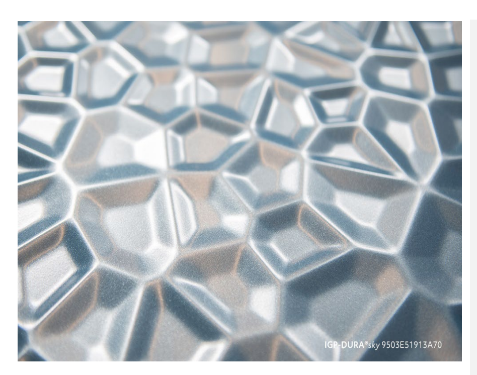
IGP-DURA®sky is a fluoropolymer based coating powder which meets the demands of the standards AAMA 2605 and Qualicoat class 3.